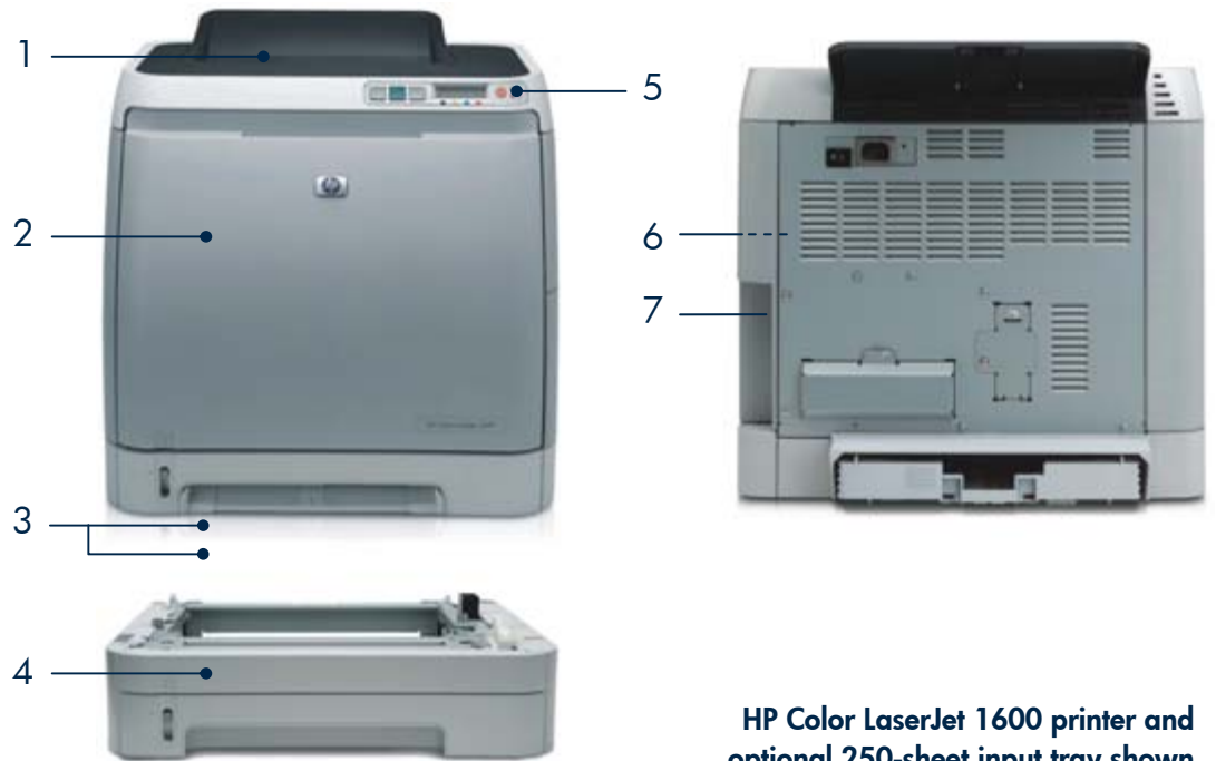
HP Color LaserJet 1600 printer and optional 250-sheet input tray shown